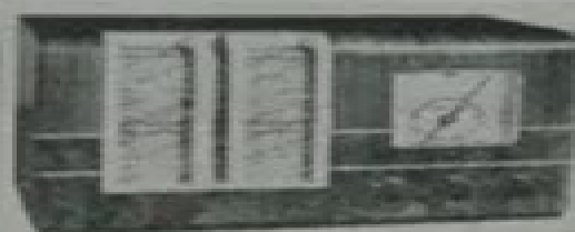
The appearance of the Ferguson 910 short-wave "Mains Minor."

S HORT waves and medium waves are covered in this worthwhile in the Ferguson 910 Mains Minor, a 4-valve (plus rectifier) superhet designed for AC mains of 200-250 V.