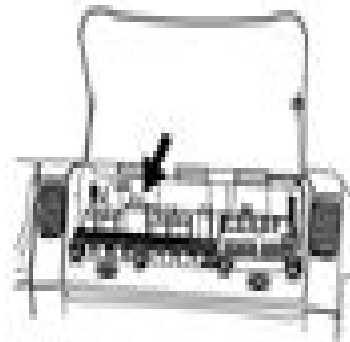
Location of supply relay and control electric unit, track. The location of the control electric unit varies in design.