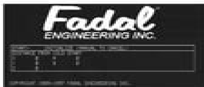
Figure 1-6 Screen display following power-on.

The Fadal logo will display on the monitor screen of the pendant when the VMC is powered on (See Figure 1-6).