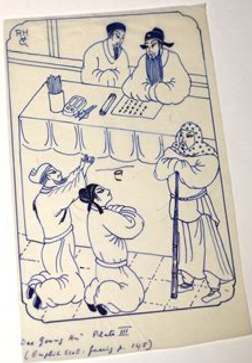
Das Jünger An' Plate III (English text facing p. 145)