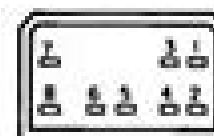
— CN701 8P CONNECTOR —