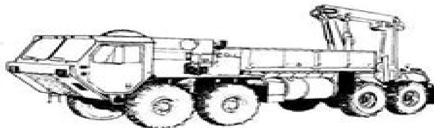
LEFT FRONT VIEW