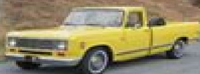
LONG HAUL 1974 INTERNATIONAL SERIES 100