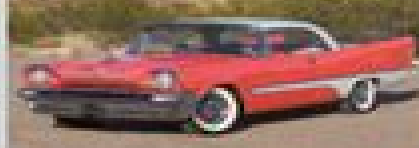
FIRESWEEP! 1957 DE SOTO SPORTSMAN