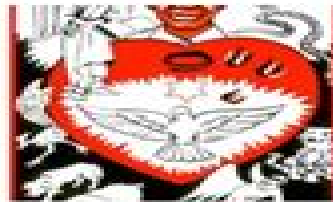
The Repenting Heart