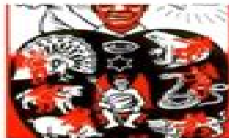
The Heart Hardened By Sin