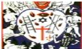
The Tempted and Divided Heart