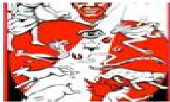
The Heart Convinced of Sin