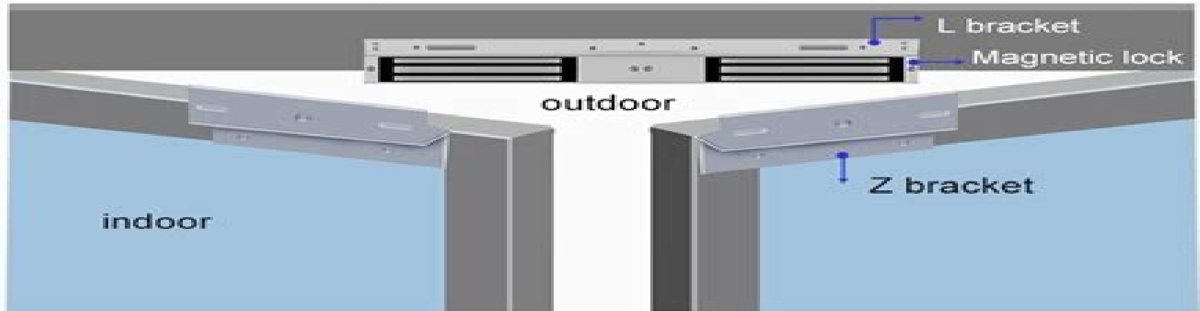
Single door display diagram