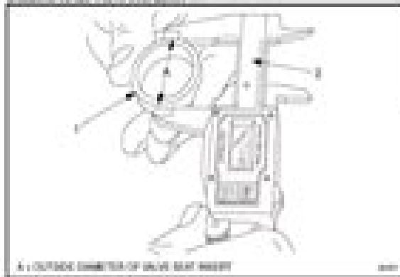
Figure 11. Measuring the Outside Diameter of the Valve Seat Inset