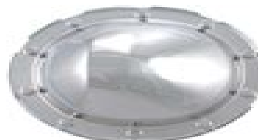
GM 10 Bolt