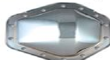
GM 14 Bolt