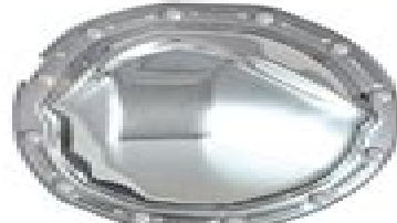
GM 12 Bolt (car)