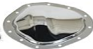
GM 12 Bolt