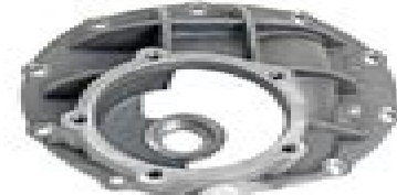
Ford 9 Third Member