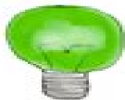
The Green Light