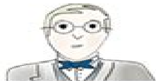
The Owl-Eyed Man