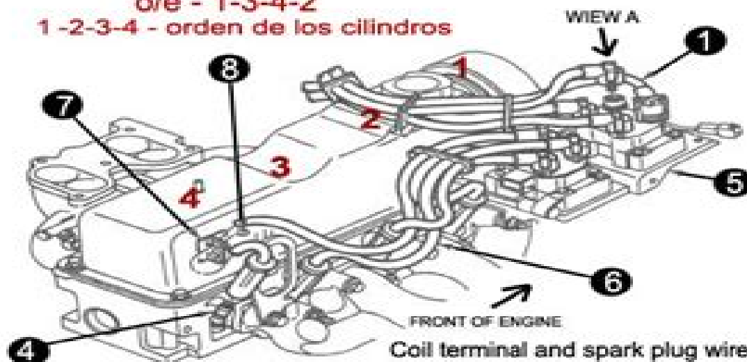
Coil terminal and spark plug wire connection points - four - cylinder engine

o/e - 1-3-4-2 1-2-3-4 - orden de los cilindros