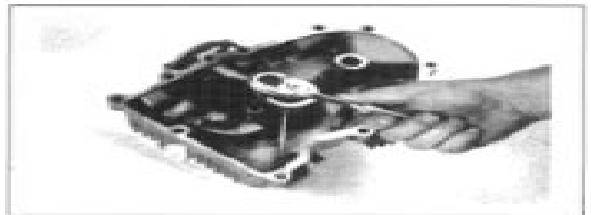
Figure 9-13. Removing Oil Pump and Oil Pickup.