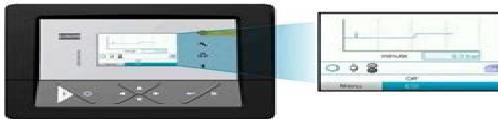
Real time trending

The superior processing capability of the Elektronikon® Mk5 enables a compressor of almost any age or type to benefit from the latest and most advanced control algorithms and functionality, resulting in improved system control and energy savings.