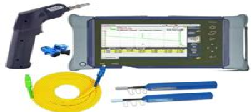
Figure 1: Equipment Requirements