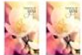
Thinking of you cards