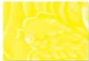
LG-61 [TL] Canary Yellow

The Art & Creative Materials Institute AP (Approved Product) seal certifies this product to be safe for use by all ages.