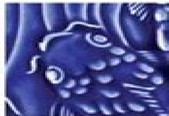
LG-21 [TP] Dark Blue