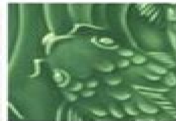
LG-40 [TP] Dark Green