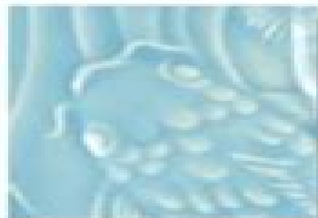
LG-24 [TP] Light Blue