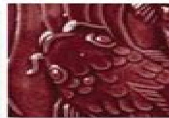
LG-50 [TL] Maroon