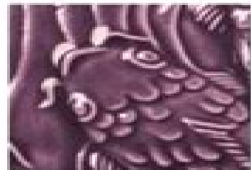
LG-55 [TP] Purple