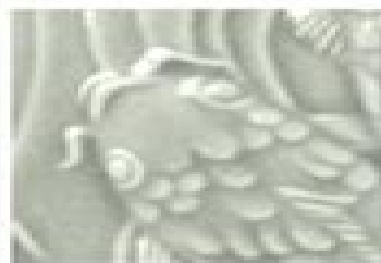
LG-14 [TL] Gray