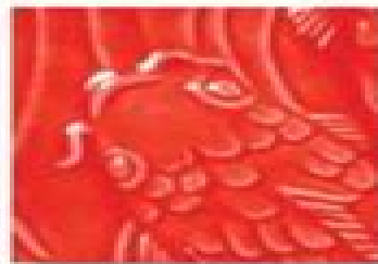
LG-59 [TL] Hot Red