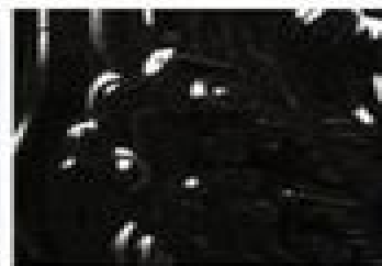
LG-1 [O] True Black