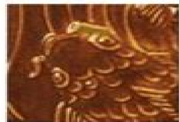
LG-36 [O] Freckled Brown