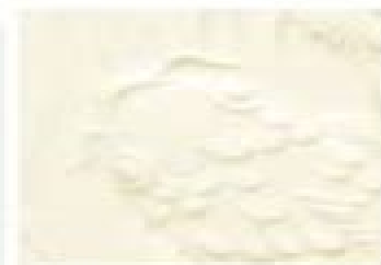
LG-10 [TP] Clear Transparent

[O]=Opaque [TP]=Transparent [TL]=Translucent