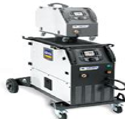
Supplied without accessories, without separate wire feeder