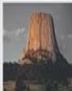
Devil's Tower, Wyoming, USA

There are three main types of rocks: sedimentary, igneous and metamorphic.