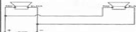
FIGURE 11 Connection of 2 EVM-15L Speakers in Parallel