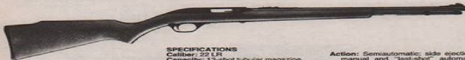
MODEL 75C $111.95

Stock: One-piece walnut-finished hardwood Monte Carlo stock with full pistol grip (shown here with Glenfield 200C, 4X scope)