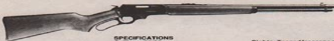
MODEL 30AS $261.95