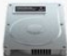
251 GB Flash Storage