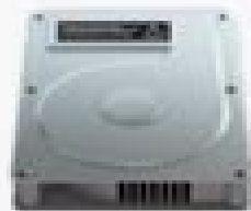
1 TB USB Disk