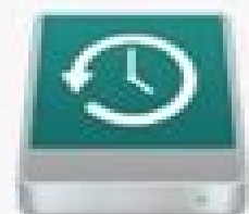
External 5 TB