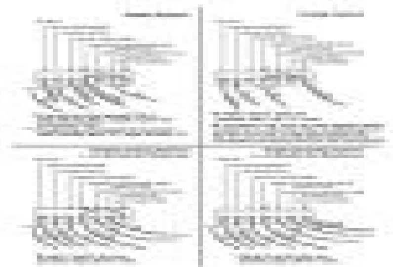
Figure 5: A schematic diagram of a building's structural system, similar to Figure 1 but with different column and slab arrangements. It shows a cross-section of a building with a central core and perimeter columns. Labels include 'Core', 'Perimeter Columns', 'Floor Slab', and 'Roof Slab'. A legend indicates that the core is made of concrete and the perimeter columns are made of steel.