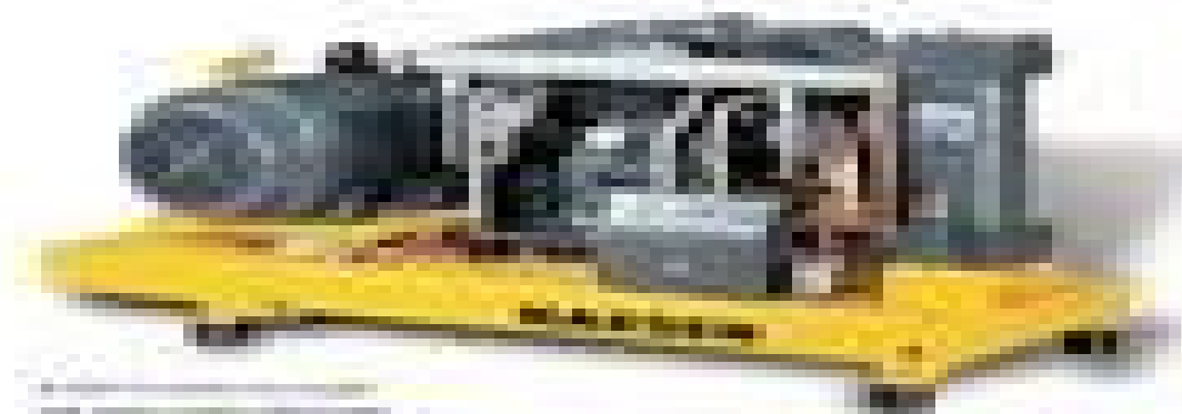
Model H 2601-01 200-watt extra pressure booster