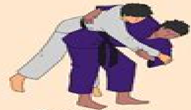
Ō GOSHI (大腰)