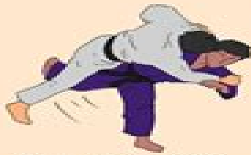
UCHI MATA (内股)