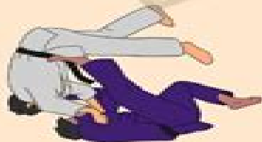
TOMOE NAGE (巴投)