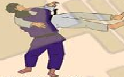
USHIRO GOSHI (後腰)