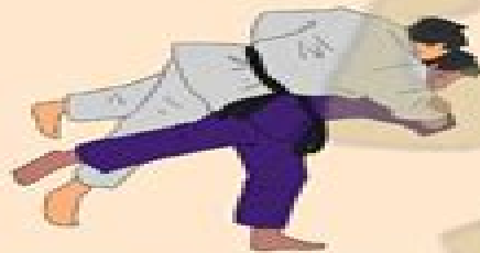
HARAI GOSHI (払腰)