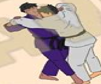
SASAE TSURIKOMI ASHI (支釣込足)