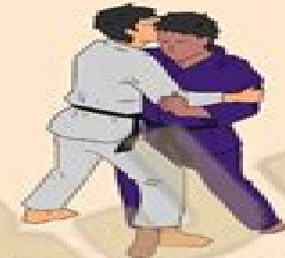
KOUCHI GARI (小内刈)