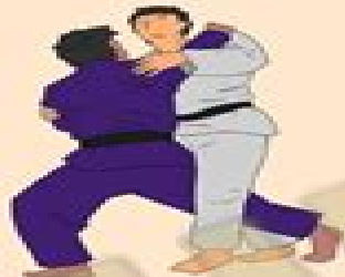
ŌUCHI GARI (大内刈)