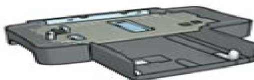
250-Sheet Plain Paper Tray Accessory (optional)