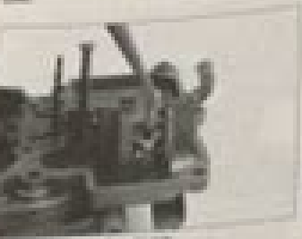
Fig. 1 Remove the float bowl and see the float mechanism

Fig. 2 The float mechanism with the float bowl removed. The float bowl is shown in the position of the float bowl. The float bowl is shown in the position of the float bowl. The float bowl is shown in the position of the float bowl.