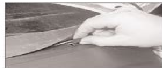
24.3 Peel back the rubber seal for access to the cowl panel retaining clips