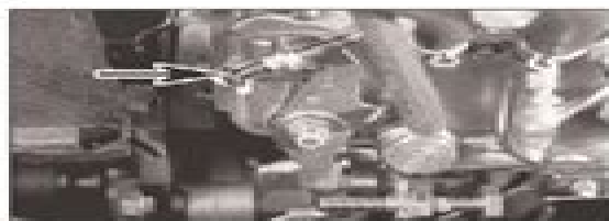
21.3 Idle speed adjustment screw (arrowed) - engine code AEF