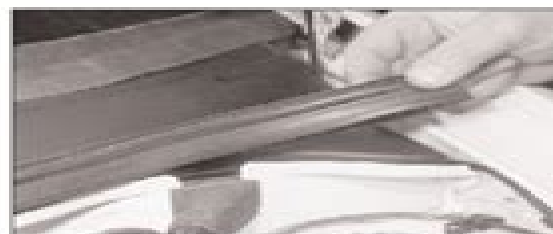
24.2 Pull off the rubber weatherstrip from the top of the bulkhead

4 Remove the cowl panel from the car (see illustration).