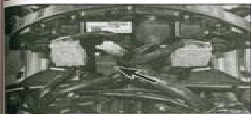
18.2a Ignition switch wiring connector (arrowed) - CBR

3 Using an ohmmeter or a continuity tester, check the continuity of the connector terminals. Continuity should exist between the terminals when the switch is in the ON position.