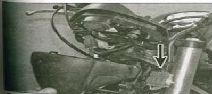
19.2a Handlebar switch wiring connectors (arrowed) - early CB

3 To access the connectors, on CB600F/FA and CBR600F/FA models remove headlight (Section 8), on CBF600N/NA models remove the headlight beam unit (Section 7), and on CBF600S/SA models remove the fairing (see Chapter 7). Trace the wiring from the switch and disconnect it at the connector(s) (see Illustrations). Check for loose or broken connections.