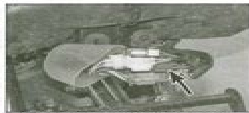
18.2d Ignition switch wiring connector (arrowed) - CBF-S/SA

2 On CB600F/FA 2007 to 2010 models remove headlight (Section 8), then remove the instrument cover (Section 15, Step 2). On CB600F/FA 2011-on models and CBR600F/FA models remove the headlight, and on CBR600S/SA models remove the fairing (see Chapter 7). Trace the wiring from the switch and disconnect it at the brown 2-pin connector (see Illustration 18.2a, b, c or d). Feed the wire back to the switch, freeing it from any ties and ties and noting the routing