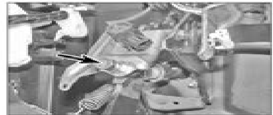
14.5b Pedal adjustment bolt (arrowed)