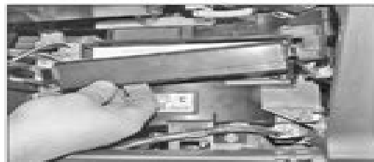
15.2 unclip the pollen filter cover