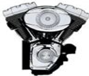
2007 Twin Cam 96 1,584 cc 80 hp