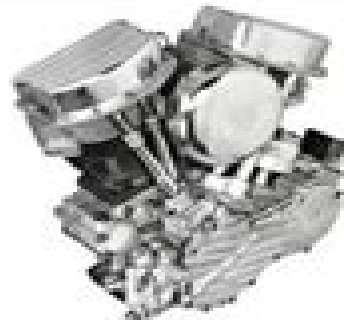
1948-1965 Panhead 990 cc & 1,200 cc 50 hp & 55 hp