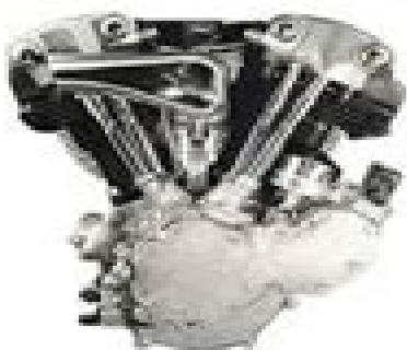
1936-1947 Knucklehead 990 cc & 1,200 cc 40 hp & 45 hp