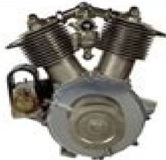
1909 First V-Twin 49 ci 6.5 hp