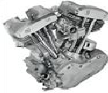
1966-1983 Shovelhead 1,208 cc 60 hp