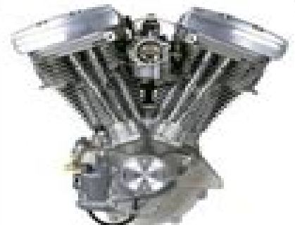
1984-1999 Evolution 1,340 cc 70 hp