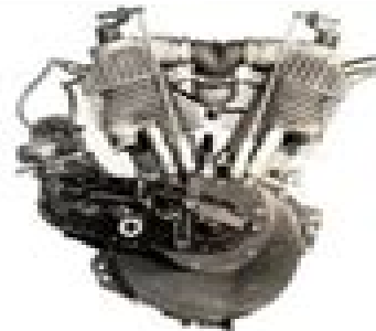
1911-1929 F-Head 50 ci 11 hp