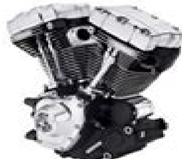
2012 Twin Cam 103 V-Twin 1,690 cc 83 hp