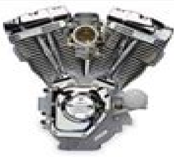
1999-2006 Twin Cam 88 1,450 cc 80 hp