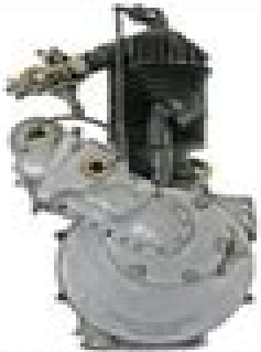
1903 Single Cylinder F-Head 35 ci 3.9 hp