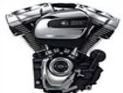
2017 Milwaukee-Eight 107 1,750 cc 92 hp