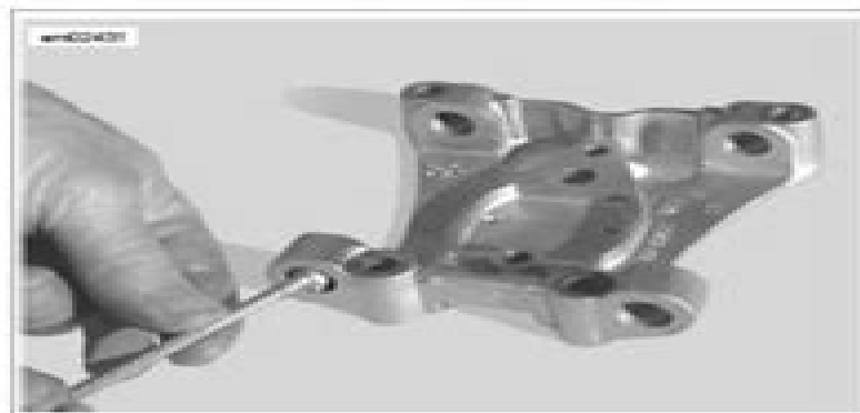
Figure 3-70. Checking Support Plate Bore