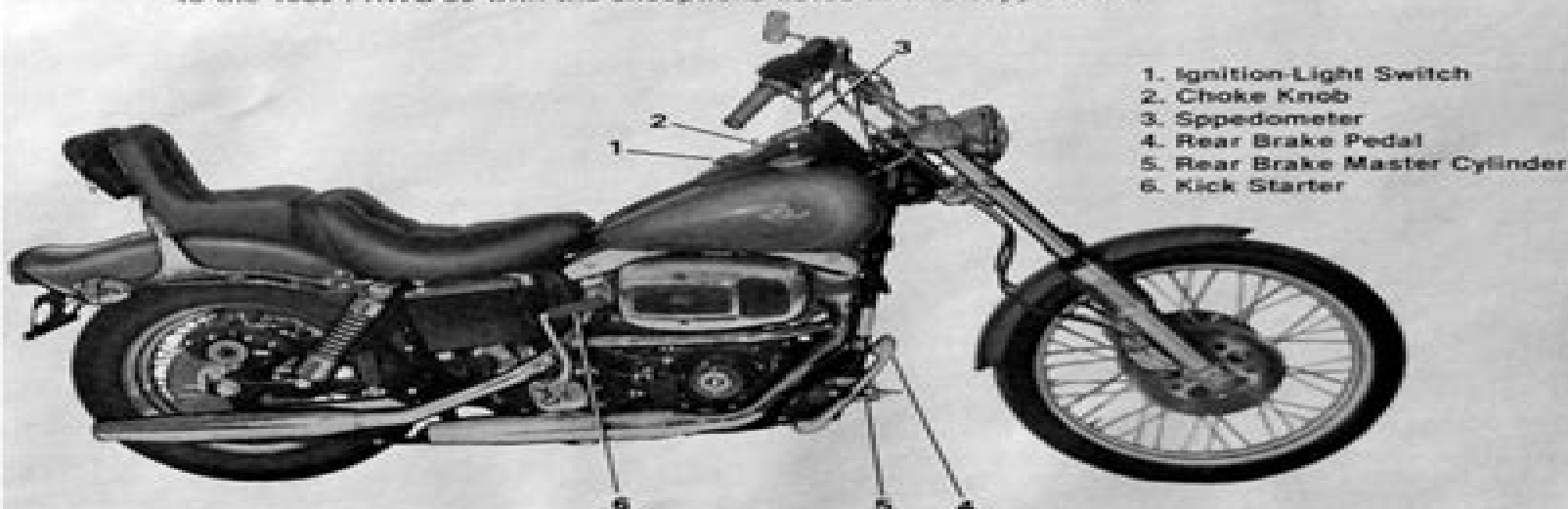
Figure 1. Right Side View — FXWG-80

The information given in the 1980 FL/FX Owner's Manual, Part No. 99460-80, applies to the 1980 FXWG-80 with the exceptions listed in this supplement.