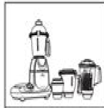
TWISTER (4 Jar)