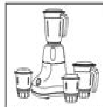
GX 400 DUO CHUTNEY JAR