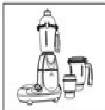
TWISTER (3 Jar)