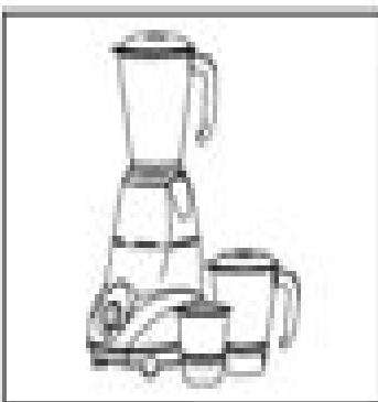
REX (2 Jar) REX (3 Jar)