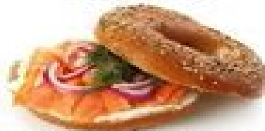
Smoked Salmon Bagel