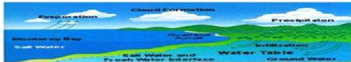
Figure 1.1: Pictorial view showing the global hydrological cycle.

It is the scientific study of hydrological cycle. Schematic diagram showing the hydrological cycle is presented in Figure 1.1.