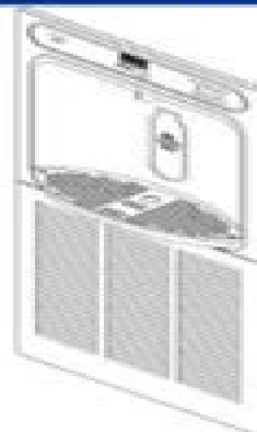
Model LZWSM8K (refrigerated)