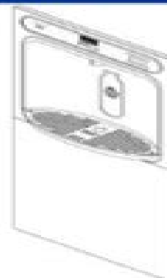
Model LZWSMDK (non-refrigerated)