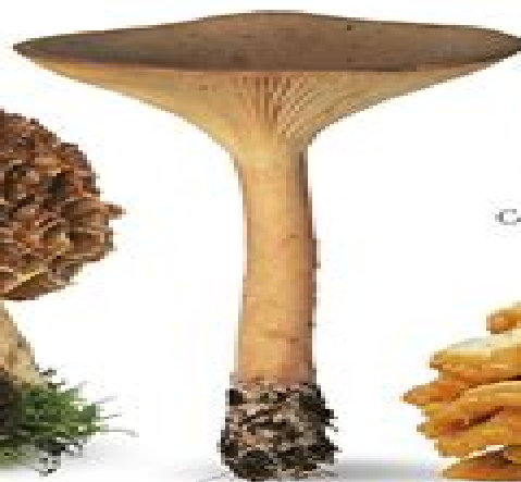
Rickstone Funnel Cap