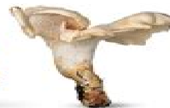
Common Hedgehog Fungus