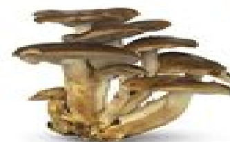
Fried Chicken Mushroom