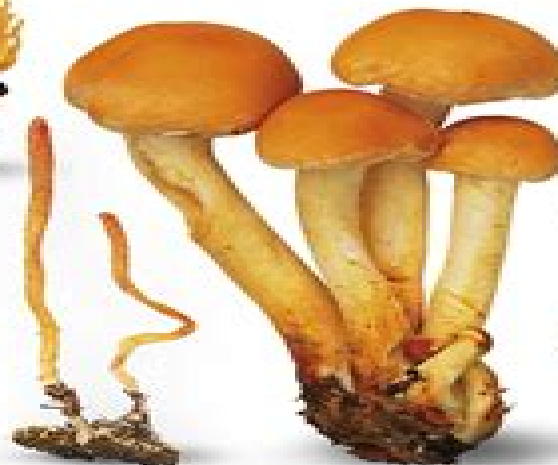
Orange Caterpillar Fungus