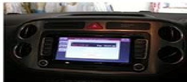
New RNS 510