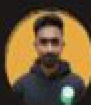
SRF 1ST RANK