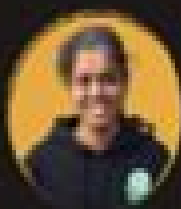
SRF 2ND RANK