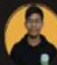
JRF 1ST RANK