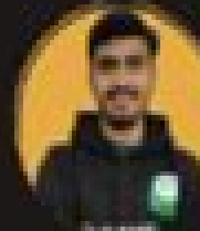
JRF 3RD RANK