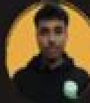
JRF 2ND RANK