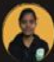
JRF 6TH RANK(CAT)