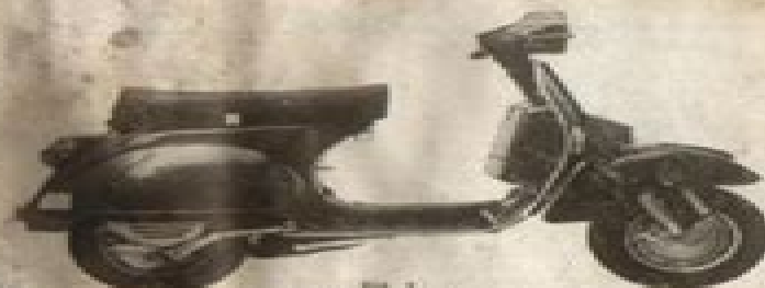
Fig. 1 Vespas PX 200 E

Antes de comenzar el servicio al vehículo se deben verificar las recomendaciones de uso que se dan en este manual. En la parte final del manual se indican los datos de los vehículos de la gama de la MOTOVESPA , así como los datos de los vehículos de la gama de la MOTOVESPA , así como los datos de los vehículos de la gama de la MOTOVESPA , así como los datos de los vehículos de la gama de la MOTOVESPA .