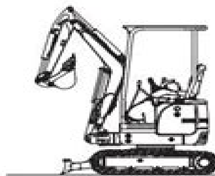
Bucket position at the time of sealing off hydraulic tank.