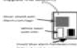
Top of Image Sensor Daughterboard