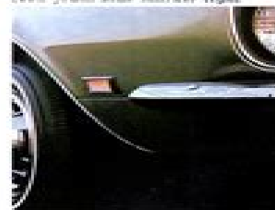
New front side marker light