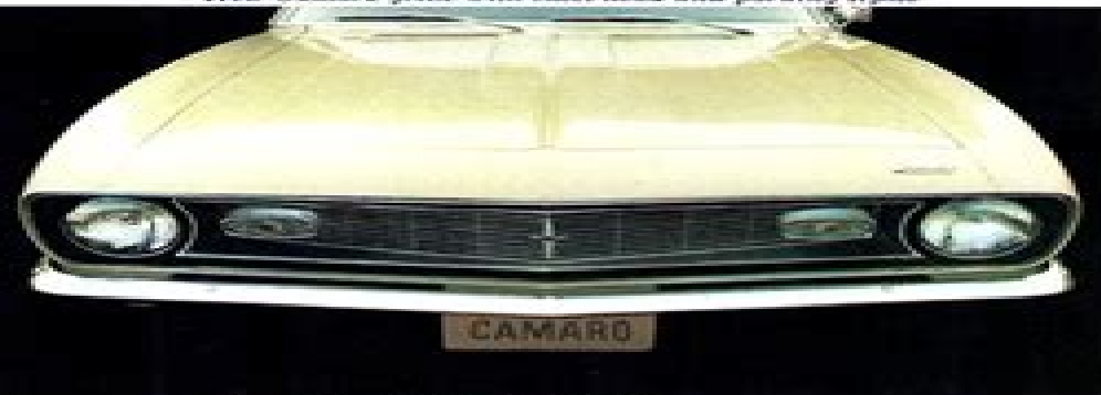
New Camaro grille with inset hood and parking lights