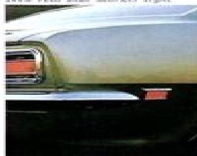
New rear side marker light