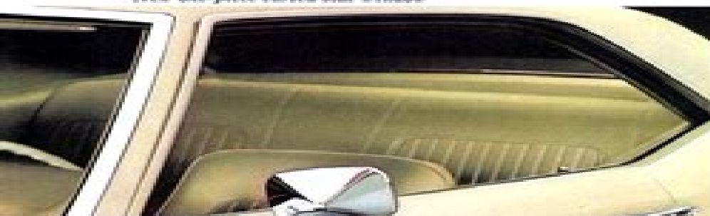
New one-piece curved side window