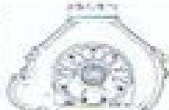
Ford TA, 289, 302, 351C, 351W