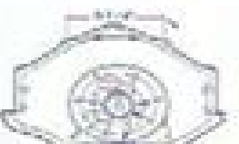
GM TH-400, 350, 250-48, 700R4, 3.80, 4.10, 4.62R Chevrolet