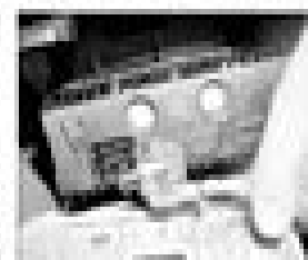
4.10 Undo the screws and disconnect the wiring from the multi-info display unit