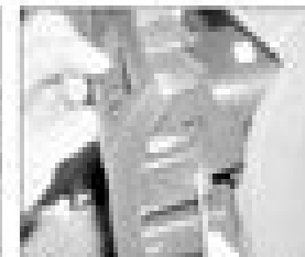
4.11 Refitting the vent panel to stop