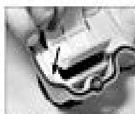
4.3 Ensure the gasket is correctly located in the carbody cover recess (removed)

7 If necessary, remove the hold bar securing the driveplate in the transmission housing