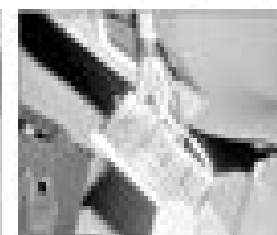
5.6 Undo the screws and withdraw the surround from the carbody