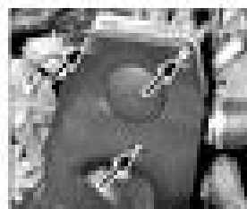
5.3 Timing belt upper cover retaining bolts (removed)