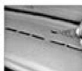
11.46a Lift off the two covers

both covers from the face on both sides (see illustration).