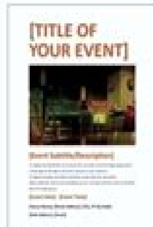
Event flyer Word FREE