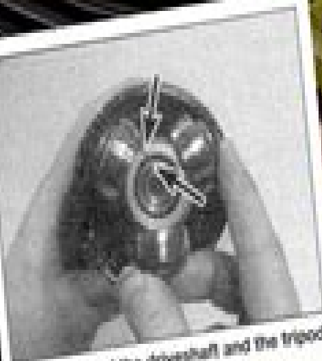
3.5b .... and the driveshaft and the tripod joint